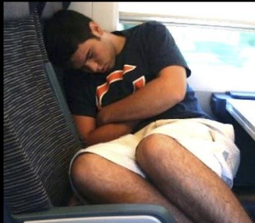
What my professors think I do