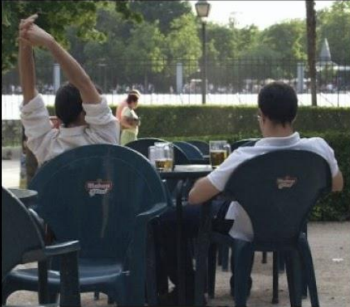
What my friends think I do