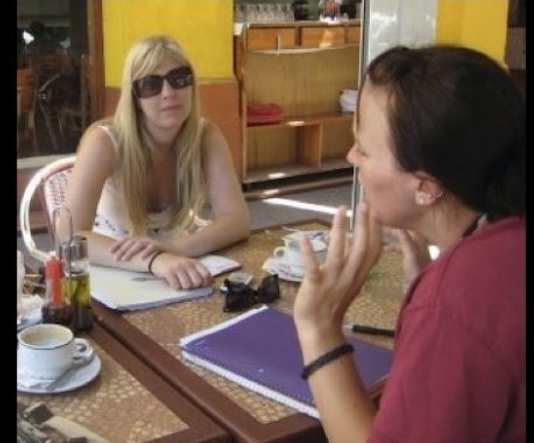
What my parents think I do